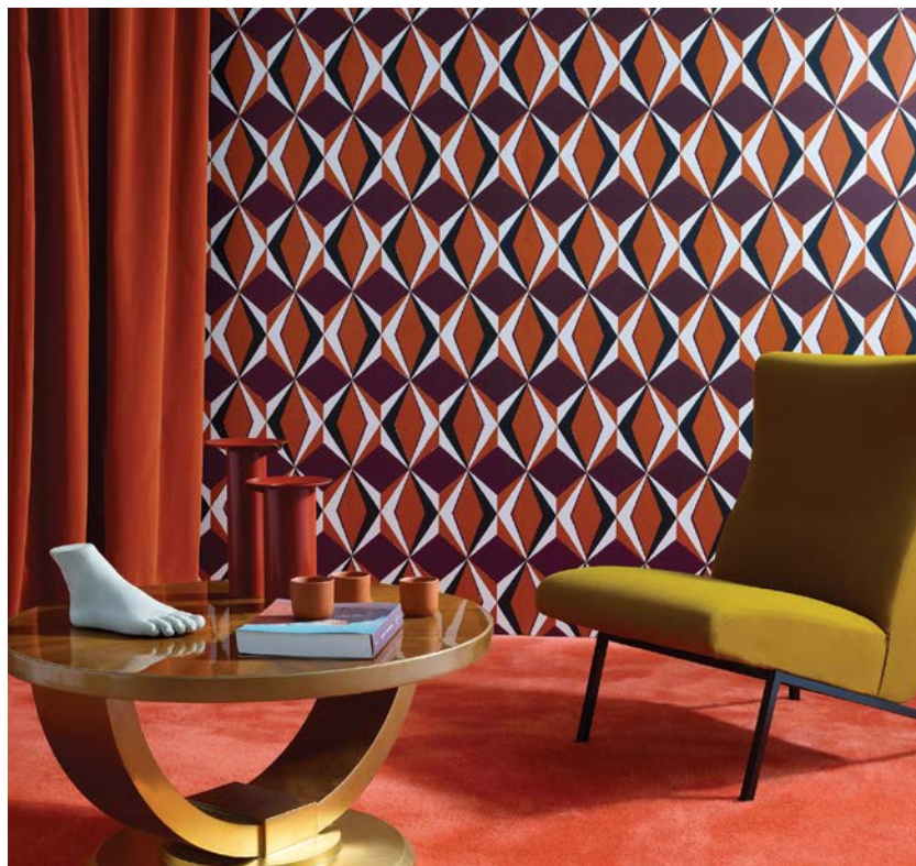
Delightful decor from the house of Evolution 21 (Top) Adamas wallpaper from the Rituel collection of Pierre Frey with a pattern from the 1950s from the house's archives. (Below)

The MissoniHome collection is designed by Rosita Missoni and produced and distributed by the Italian company of home textiles and furnishings T&J Vestor. The collections feature the wonderful world of Missoni prints, the house's signature, bursting forth in various captivating mosaics. Flowers and plants, gardens filled with myriad species emanate from the textile and wall covering collections of Casamance. Cotton, satin, jacquard, natural linen and sumptuous embroidery remain the hallmarks of the house's creations.